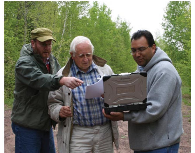
Left Photo: Solar Panels in Montana. Right Photo: Staff exploring aggregate resources in Wisconsin.

The Division of Capital Investment manages the Indian Loan Guaranty, Insurance and Interest Subsidy Program. In an effort to assist Indian tribes and individuals to establish or expand Indian-owned businesses, and to move toward self-sufficiency, Congress passed the Indian Financing Act of 1974. The Act was established to provide reservation businesses with access to investment capital equal to that available to businesses in non-reservation areas. The Secretary of the Interior is authorized to guarantee up to 90 percent of unpaid principal and interest, reducing the risk of the lender, thus enabling them to make loans to less conventional borrowers. The Program also authorizes interest subsidy on qualified, guaranteed, or insured loans which reduces the interest payable by the borrower, thus increasing cash flow for business activities.